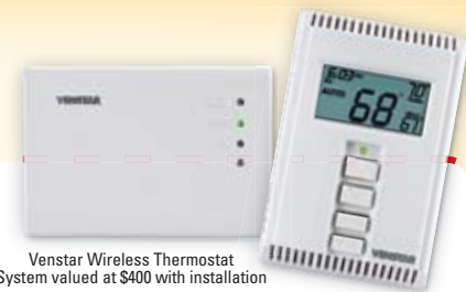
Venstar Wireless Thermostat System valued at $400 with installation

Your purchase may qualify for a tax credit of up to $1,500